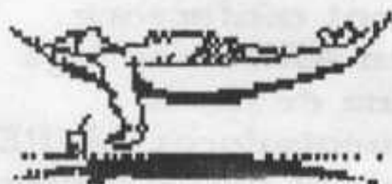
YOU'VE HAD YOUR REST !