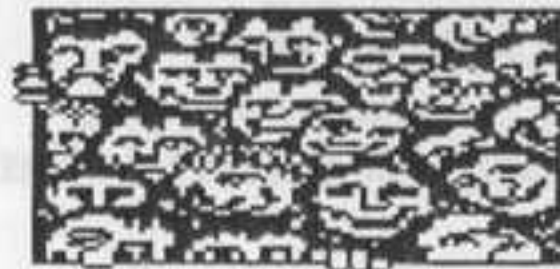
JOIN THE BEST !